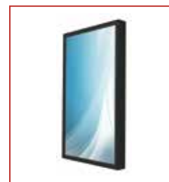
Portrait model, CLP-47PLC68-OB

Patented Dynamic Thermal Transfer™ system keeps internal components safely warmed in extreme cold and properly cooled in extreme heat