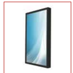
Portrait model, CLP-42PLC68-OB

Patented Dynamic Thermal Transfer™ system keeps internal components safely warmed in extreme cold and properly cooled in extreme heat